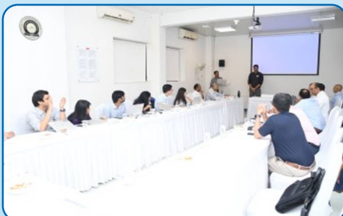
Robit starting the meeting