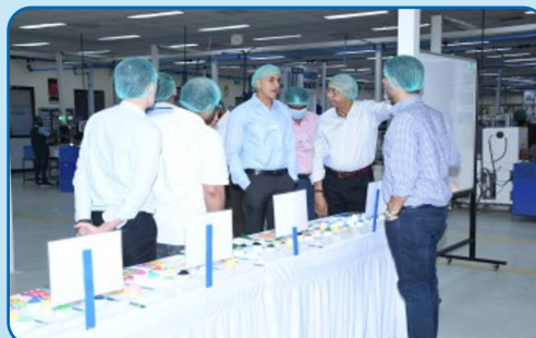
Shopfloor visit to explore new ideas