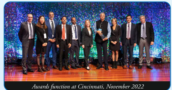
Awards function at Cincinnati, November 2022

P&G External Business 3 TIME WINNER Partner of the Year